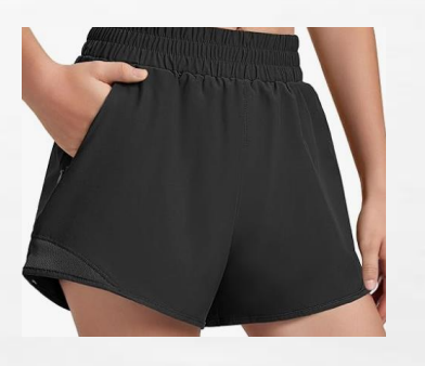
No nylon or athletic shorts